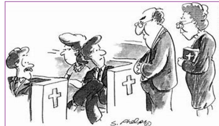
The whole church watched with nervous anticipation as the visitors sat where the Martins have sat for 42 years.